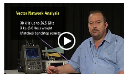
Vector network analysis