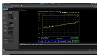
Instrument Control Software