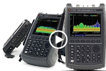
FieldFox Handheld RF and Microwave Analyzers