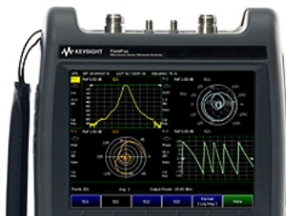
N9927A FieldFox Handheld Software